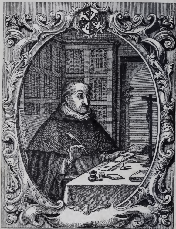
VEN. LOUIS OF GRANADA, O. P.