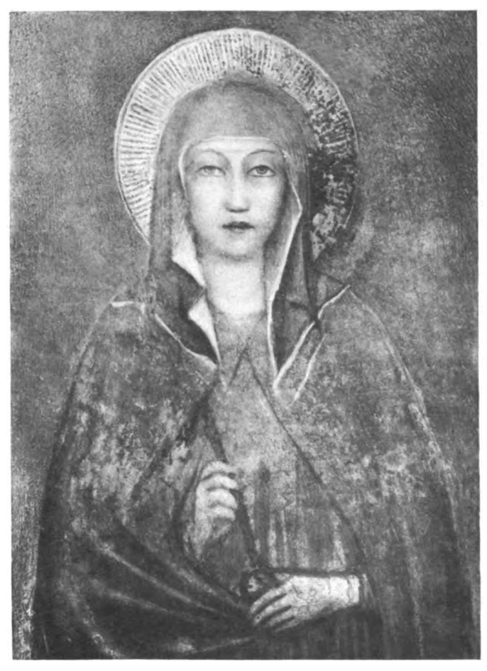
The Scraphic Mather,