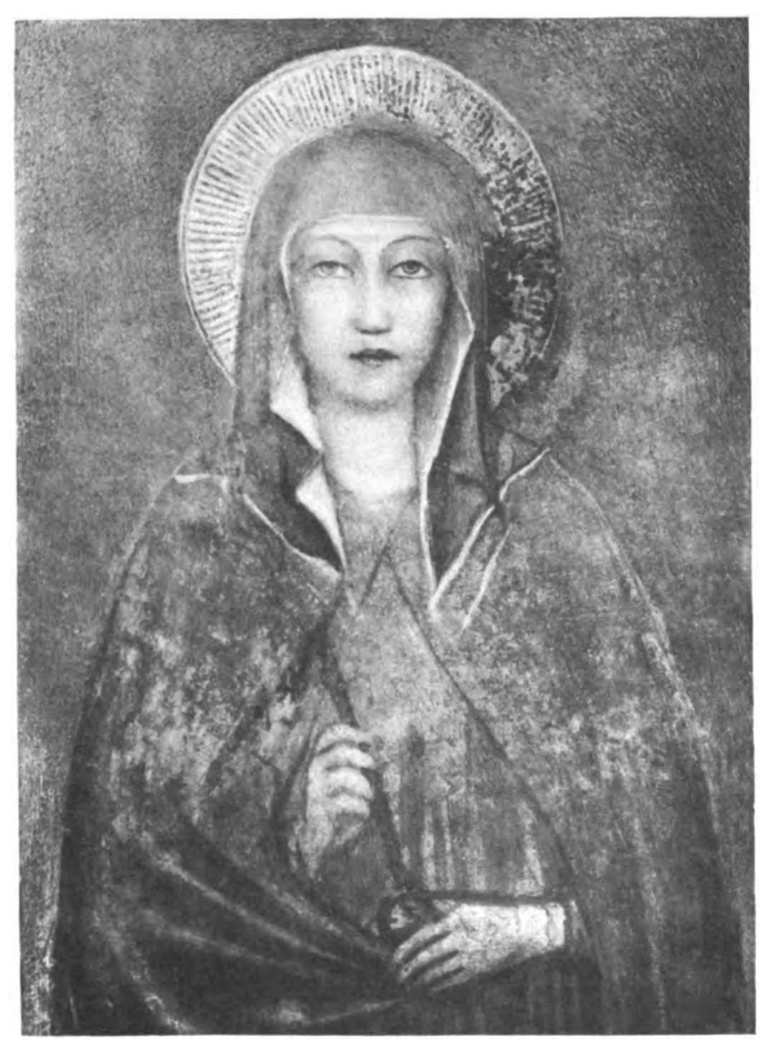
The Scraphic Mather, pour reference of Action