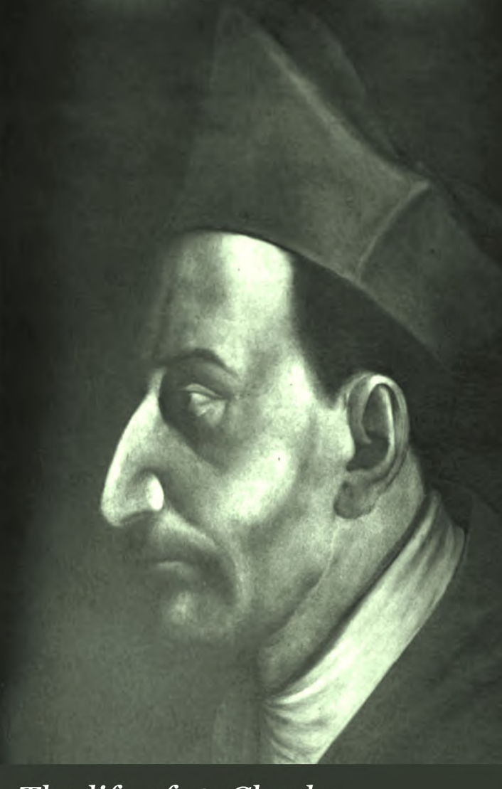
The life of st. Charles Borromeo. From the Ital