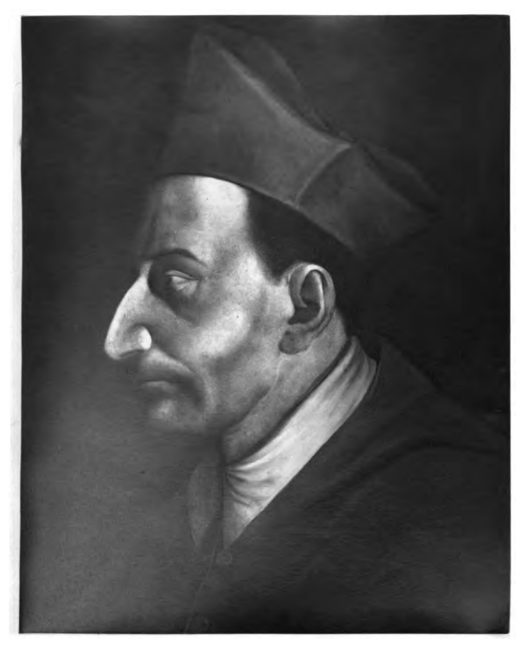
ST. CHARLES BORROMEO.