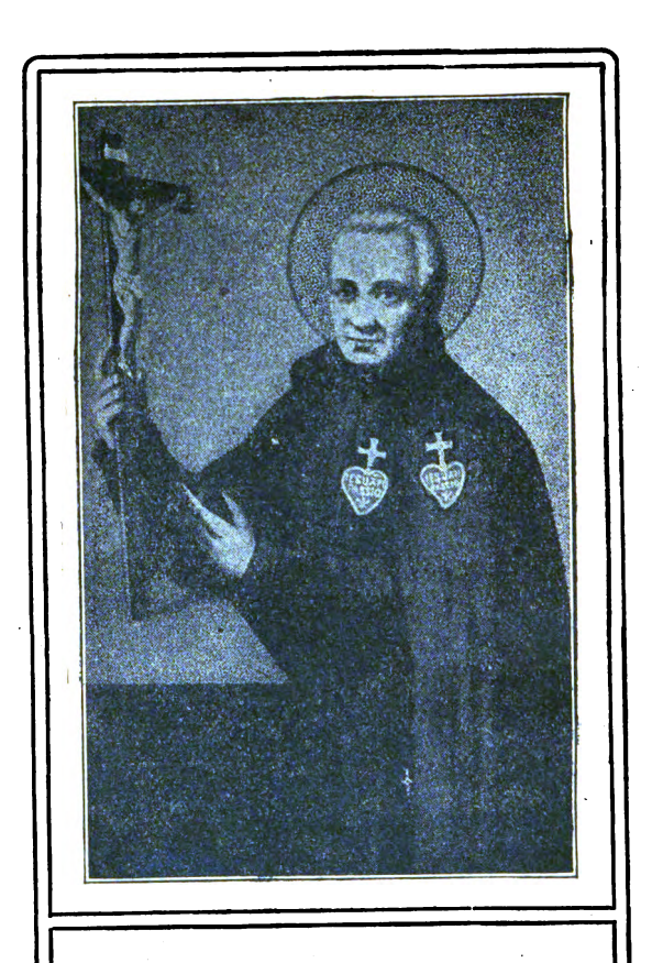
St. Paul of the Cross