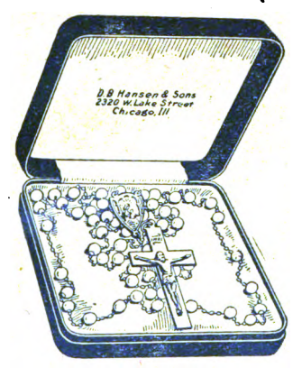
Each rosary in a satin lined case.