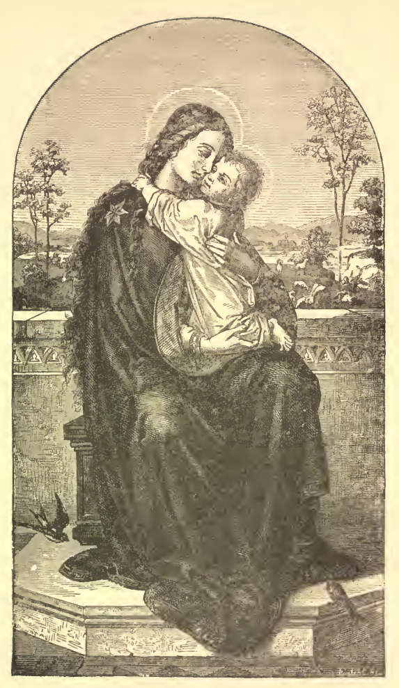
HOLY MOTHER OF GOD, PRAY FOR US!