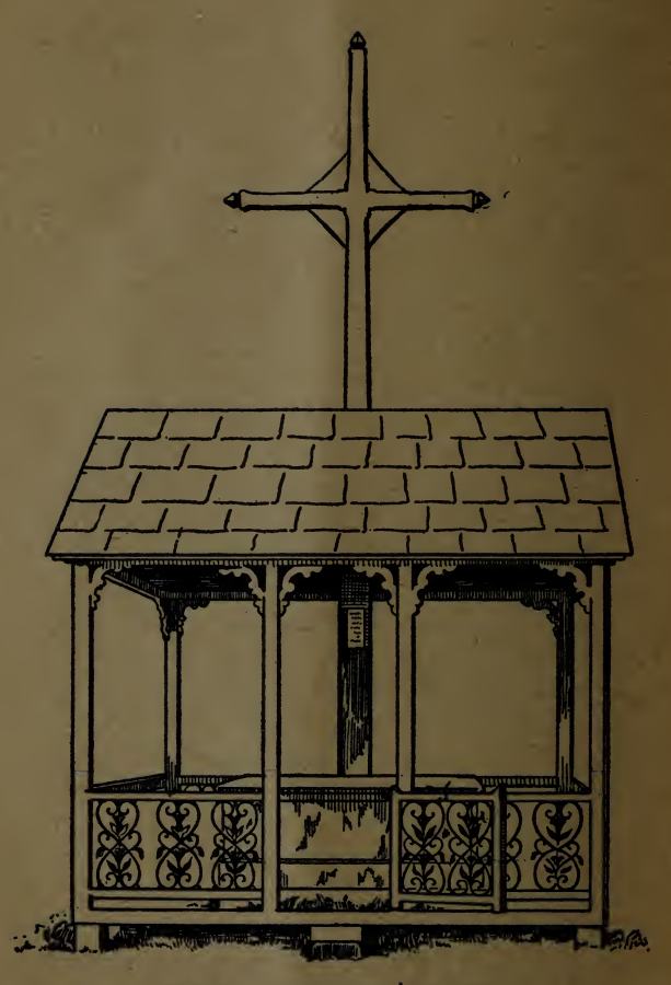
KATERI TEKAKWITHA'S SHRINE AT THE FOOT OF THE LACHINE RAPIDS NEAR MONTREAL